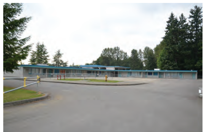
Temporary parking lot during construction.