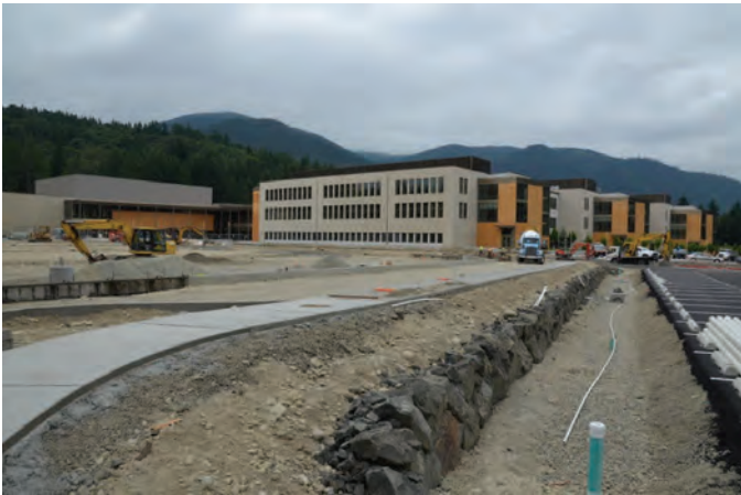
View from the new entrance drive toward the building entry.