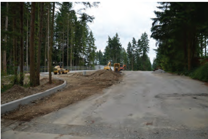
New parent drop-off/pick-up and parking curbs and sidewalks underway prior to paving 8/17/11.