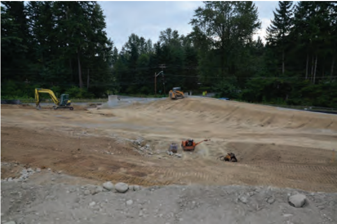
Retaining walls and detention pond underway.