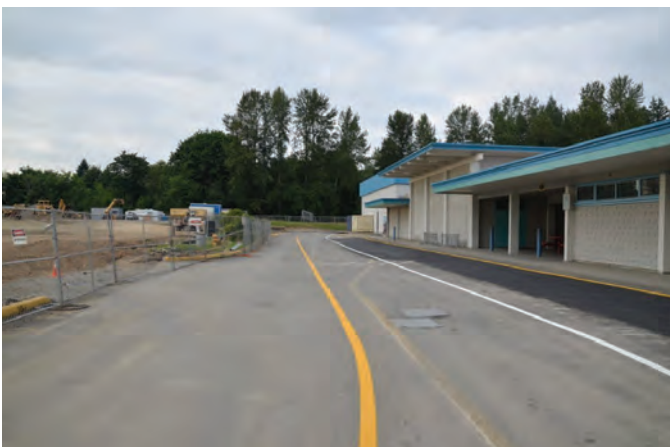
Temporary drop-off/pick-up area during construction.