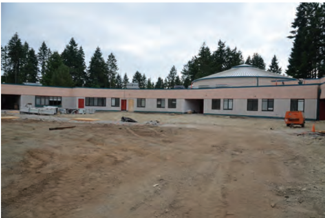
Courtyard area, covered walkway structure removed, amphitheater filled, old asphalt removed prior to reconstruction.

At left, new Admin/Counseling areas have been expanded into the original rotunda; wall-framing nearly complete.