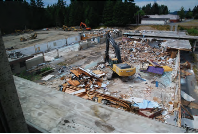
Demo of the last portion of the original campus.