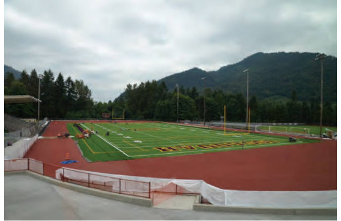
Football field installation near completion.