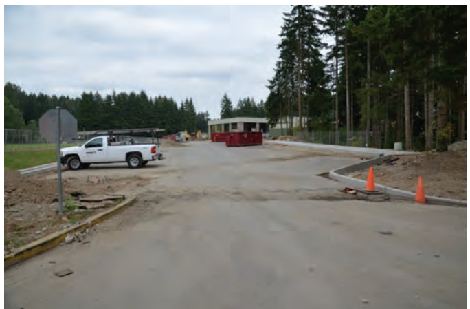
New area for bus drop-off/pick-up underway.