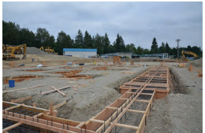
North classroom wing footings ready for concrete pour.