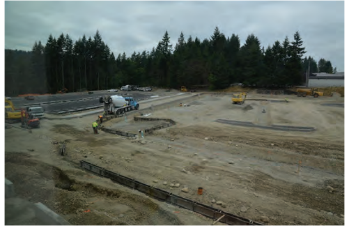
New parking lot and drop/off pick-up area, curbs and sidewalks being poured, asphalt to follow.