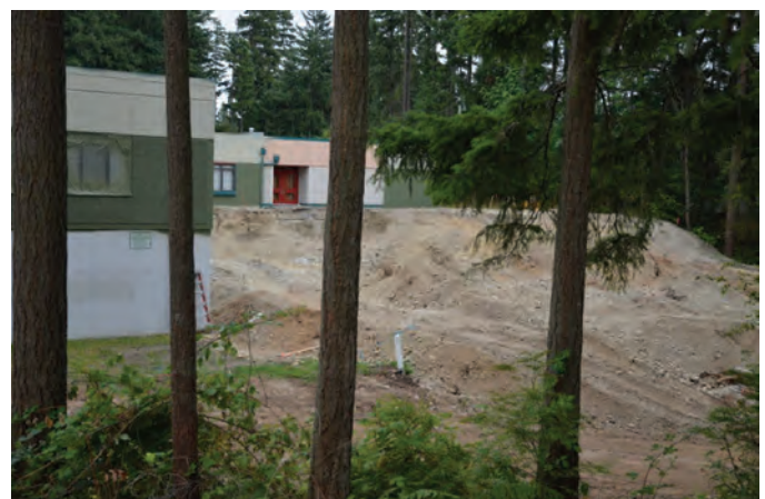
Area of new classroom addition, shoring of existing building complete.